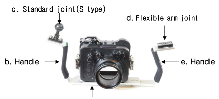
a. Tray for Patima G series housings